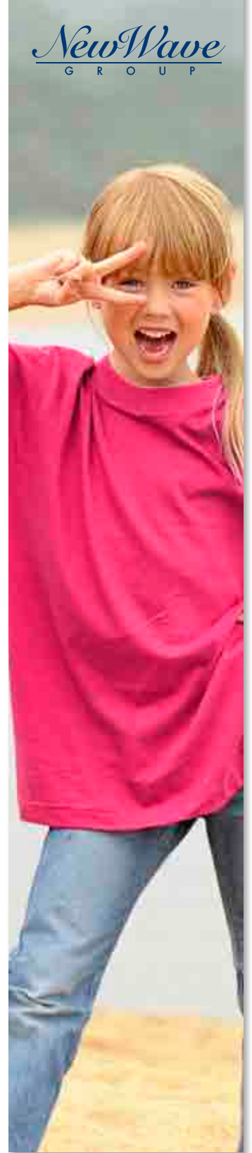
Bilder från Kosta Boda, D&J, Craft och Clipse.